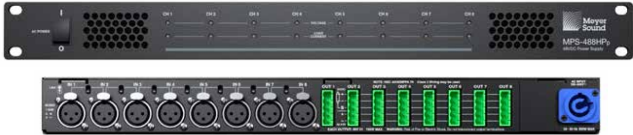
MPS-488HPp shown with Phoenix output connectors; MPS-488HPe also available with EN3 output connectors