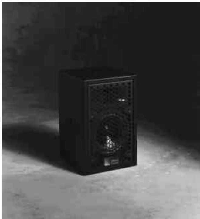
MPS-305 Reinforcement Loudspeaker

Designed for sound reinforcement applications requiring absolute minimum size, the ultra-compact MPS-305 delivers full-range performance with very low distortion. The loudspeaker comprises a single 5-inch low-frequency cone driver and 2 by 5 inch horn-loaded piezoelectric high-frequency element.