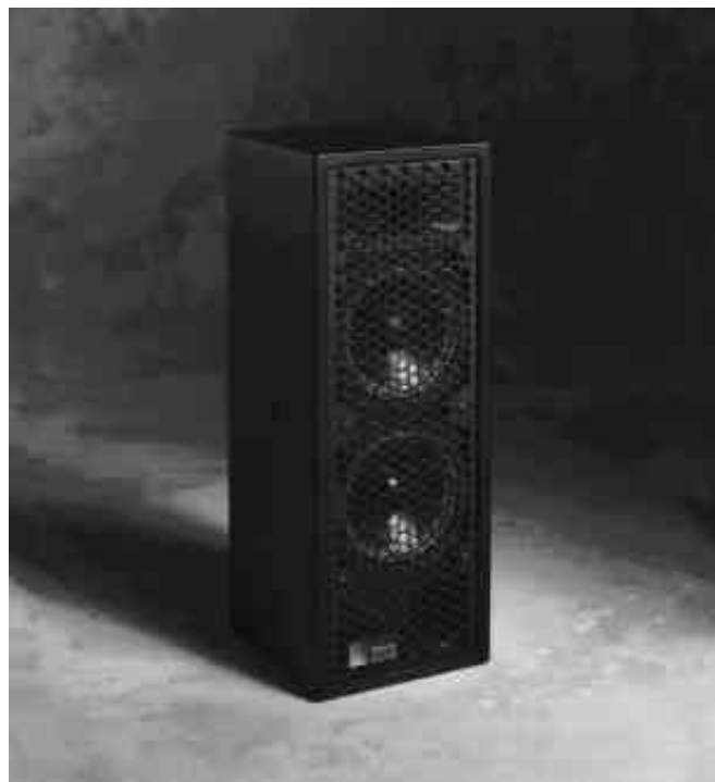
MPS-355 Reinforcement Loudspeaker

Measured at 1 meter on axis, pink noise input, in third-octave bands with half-space loading.