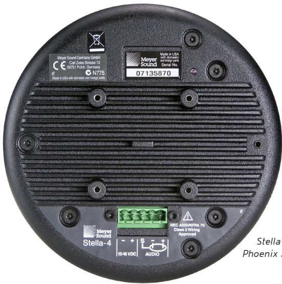
Stella-4 rear panel with Phoenix 5-pin male connector

techsupport@meyersound.com www.meyersound.com