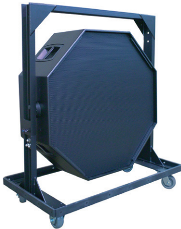
Shown with optional MYA-SB2 Mounting Yoke and MCF-SB3F Caster Frame